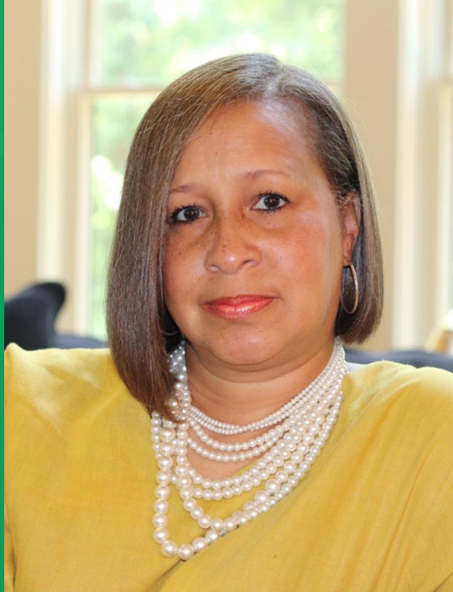
Link Tevi Rice Magnolia (GA) Chapter