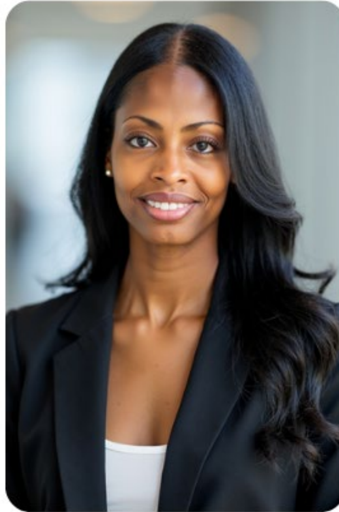
Co-Principal Investigator of VOICES of Black Women