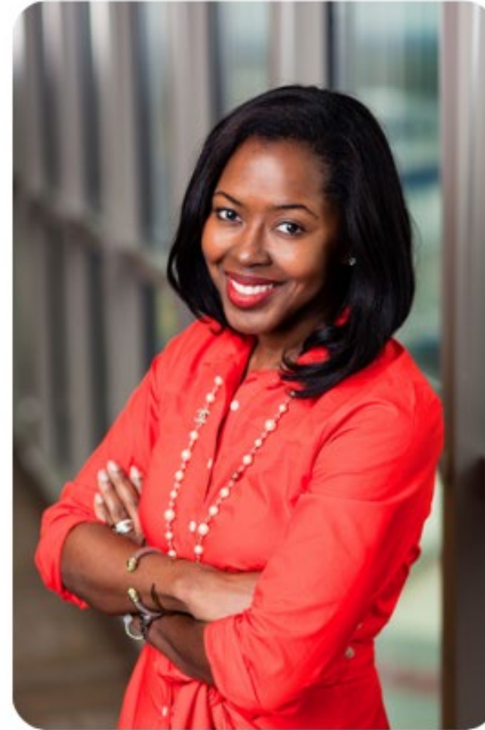
Managing Counsel, The American Cancer Society